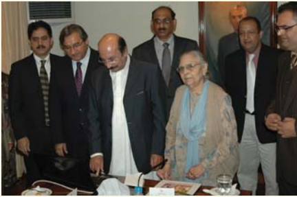
Hon'ble Chief Minister, Sindh, Syed Qaim Ali Shah announces 1200 new schools to be established as part of the SEF's Integrated Education Learning Program