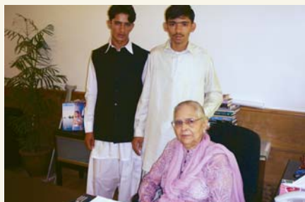
SEF acknowledges the first two students of the Child Development Center upon achieving matriculation