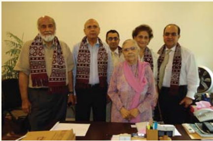
Representatives of the Punjab Education Foundation on a visit to SEF Head office