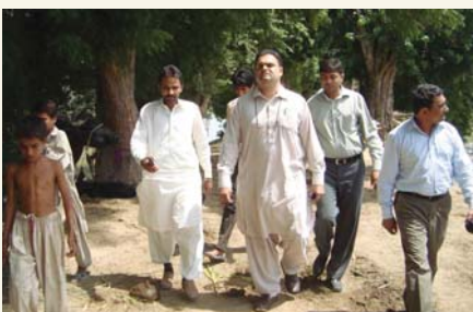
Director SEF on a visit to SEF's Flood Relief Camp at Village Ubhri, Khairpur