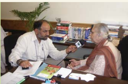
MD, SEF highlighting PPRS Project details to Radio Pakistan during a media briefing at SEF Head Office