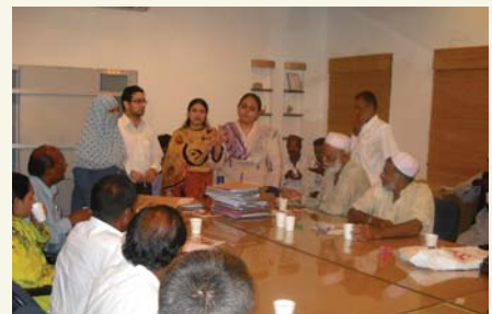
SEF signs contract with 300 existing private schools to be supported under IELP