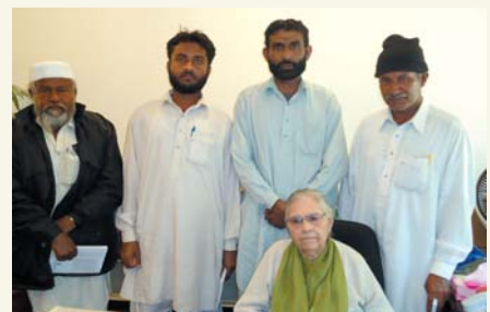
Representatives from Prosperous Coastal Area Community, Rehri Bin Qasim Town, Karachi on a visit to SEF