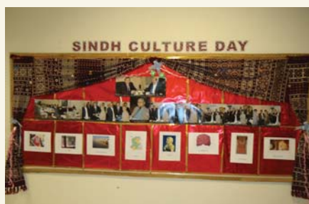
SEF celebrates Sindh Culture Day in December 2010