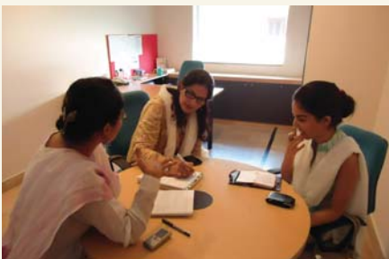
Coordinator PPRS Project in a meeting with World Bank representatives at SEF sub-office in Karachi