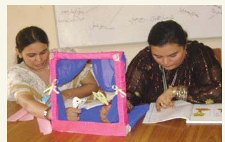
Members of SEF's Learning Support Unit demonstrating interactive teaching-learning methodology for early years classrooms