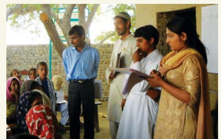
LSU trainers conduct classroom support visit to school in rural areas