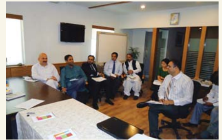
SEF management briefs World Bank mission on the progress of the PPRS Project