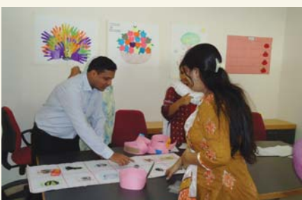
SEF trainers demonstrate low-cost learning resources developed in-house for classrooms