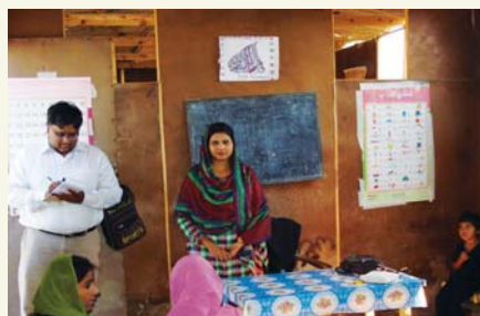
Senior Manager, Monitoring & Evaluation Unit, on a school monitoring visit