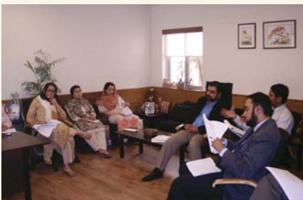
SEF and World Bank teams discuss details of assessment framework for teachers and students in partner schools