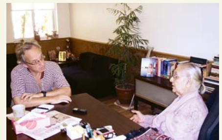
DFID representatives in a meeting with MD, SEF