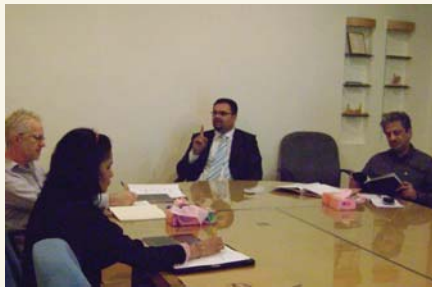
Director, SEF discusses details of IQEP in a meeting with members of the Foundation Open Society Institute and Pakistan Center for Philanthropy